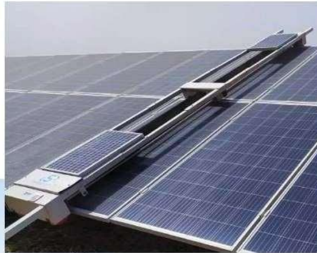
Ground Mount Solar Power Plant