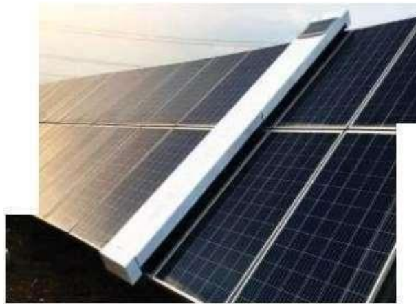
4 Meter length robot