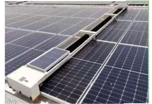
6 Meter length robot