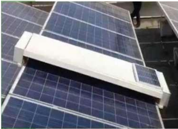
2 Meter length robot